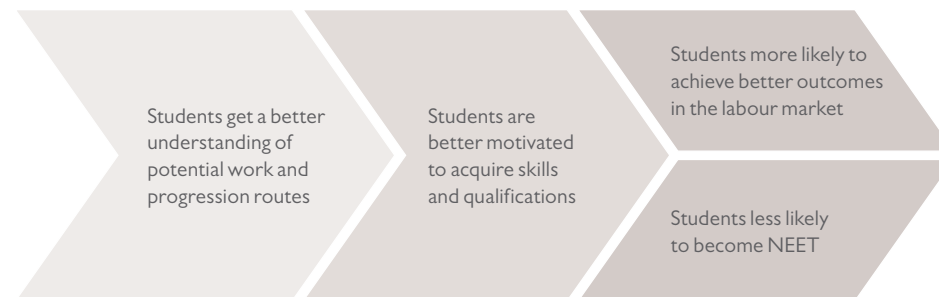
Figure 3: PwC's impact pathway