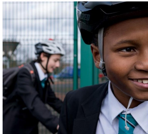
Sustrans school programme, 2019