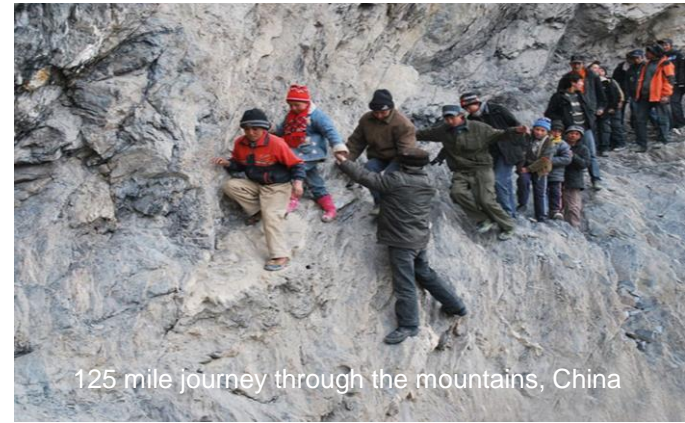
125 mile journey through the mountains, China