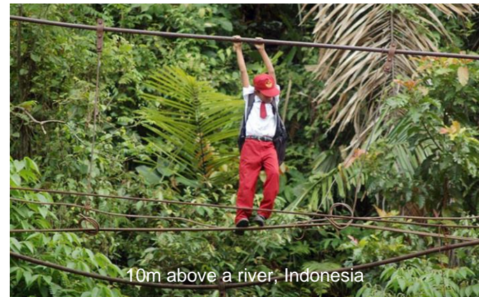
10m above a river, Indonesia