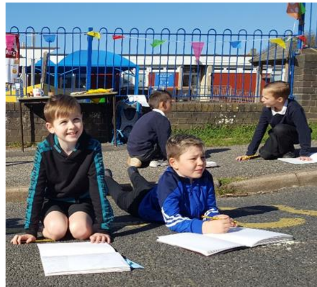
Denton Community Primary School, 2019

Helps us to all keep a safe distance and gives you the opportunity to get exercise and breathe cleaner air outside your school.